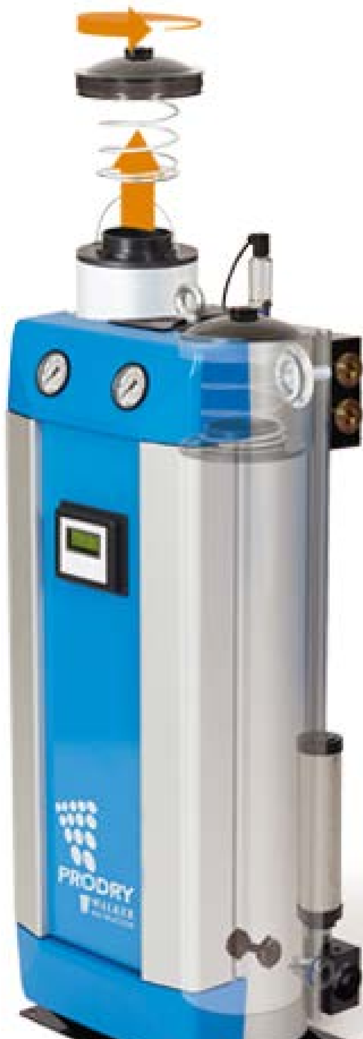
Desiccant Compressed Air Dryer